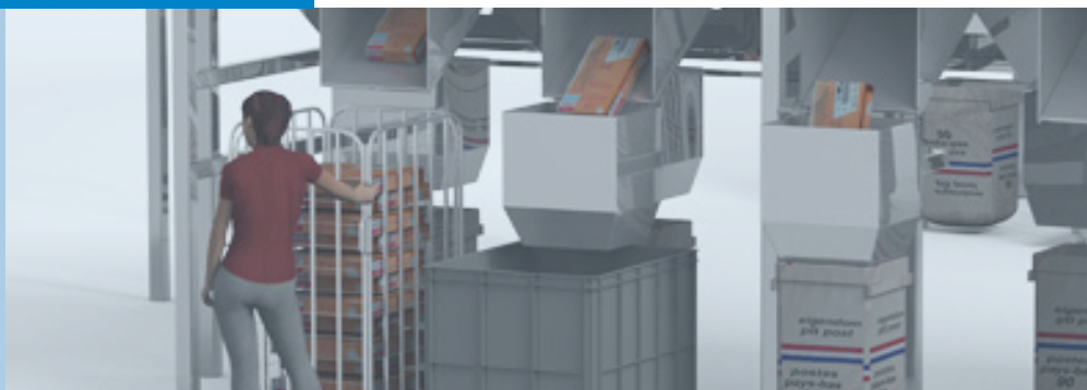
Cartons , chutes roll cages, trolleys or postal bags

Possible exits include cartons, roll cages, postal bags, trolleys or chutes..